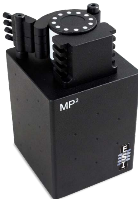
Flow Rate Calibration for Peripump Tubing Based on RPM

Tubing available from 0.13 mm i.d. to 3.17 mm i.d.