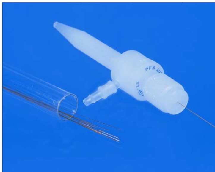
Obstruction Removal Kit shown with PFA-ST Nebulizer (not included)